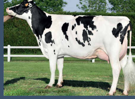
All.Nure Supersire Eleonor VG-85-IT VG-MS 3yr. Huge transmitting production star

The first generation of Eleonor sons already will be influential to the breed with numerous sons selling to international AI stations. DG Albero Eliott is the World's #2 GTPI son of Wickham. Eliott is at Cogent and combines a great mix between production (+90 Fat / +61 Protein) with almost 2 points PTAT. Her highest son DG Albero Eldorado is international marketed by AI Total, he is in the Top 10 of Montross sons and international sire of sons, mating sire for flushes and a premier choice of many commercial dairy farmers around the World with his index most dairy farmers are looking for: +2358 Milk with a plus on % Fat & Protein resulting in +104 lbs Fat and +79 lbs Protein, combined with +1.1 DPR, easy calvings (SCE 6.4) and >2 points for PTAT (with a positive teat lenght and sloped rumps)!! It's the Eleonor family which we have to keep in mind as a key source for high production genes which combining the complete package!