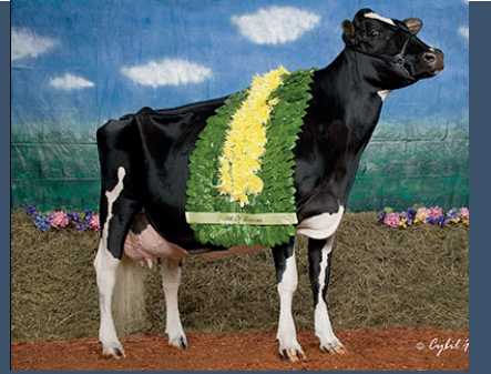
Savage-Leigh Licorice EX-92-USA Same cow family - mat. sister to Eleonor her 3rd dam

DG Albero Eldorado I GTPI +2768 International sire of sons