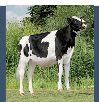
DG Albero Elise | GTPI +2750 #1 GTPI Montross in Europe