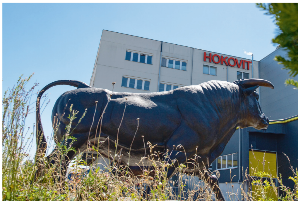
In addition to the production of micronutrients for animal feed and a high-quality Holstein breeding program (Hokovit Genetics), Hokovit is active in four different areas of business, including the production of premium meat under the Qualivo label.

Diamond via Adagio. Her highest daughter is a 2861 gTPI Gameday, but what impresses us even more is her own production ability. After 256 days of her 1st lactation, she has already produced 11,326kg/24,970lb 3.91% 3.57%.