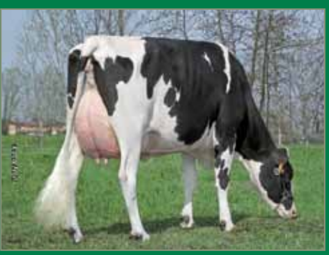
Selvino daughter BG E.T. daughter