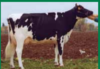
Chemello Jocko Benge VG-87-IT 2yr. Brood cow extraordinaire