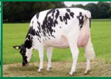
Westrik Chemello 1 VG-89 Great Duplex dtr out of Chemello Jocko Benge

Uva's influence continued through Poster's Slocum sister, Chemello Slocum Gia VG-88-IT. Gia provided considerable excitement in Italy when her Mtoto son, Chemello Mtoto Zarik, debuted at 4th place in the Italian proven sire top ranking in 2004, jumping to the leading #1 position a run after!! With this top ranking he became one of the highest proven sons of Mtoto which made him popular all over the world. Nowadays, Zarik has over 10.000 dtrs milking in more than 10 different countries.