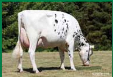
Anderstrup Laudan Cherri VG-89-DK Dam to De-Su Capricorn @ ABS